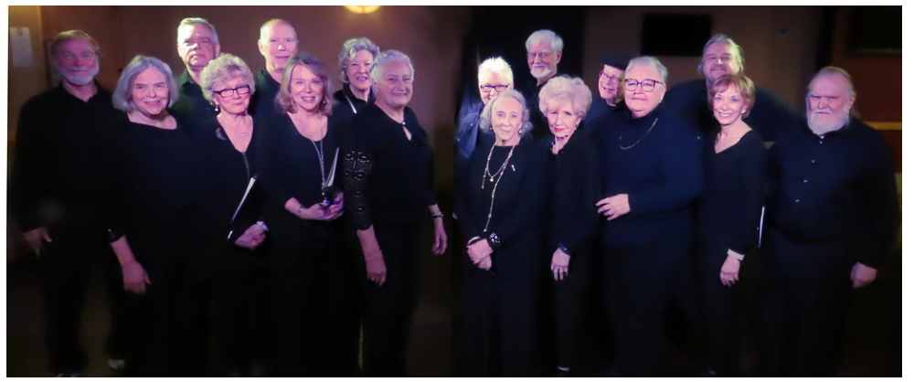
Everyone is welcome—Come join the Fun!